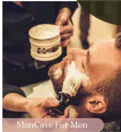
ManCave For Men