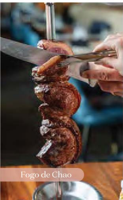
Fogo de Chao